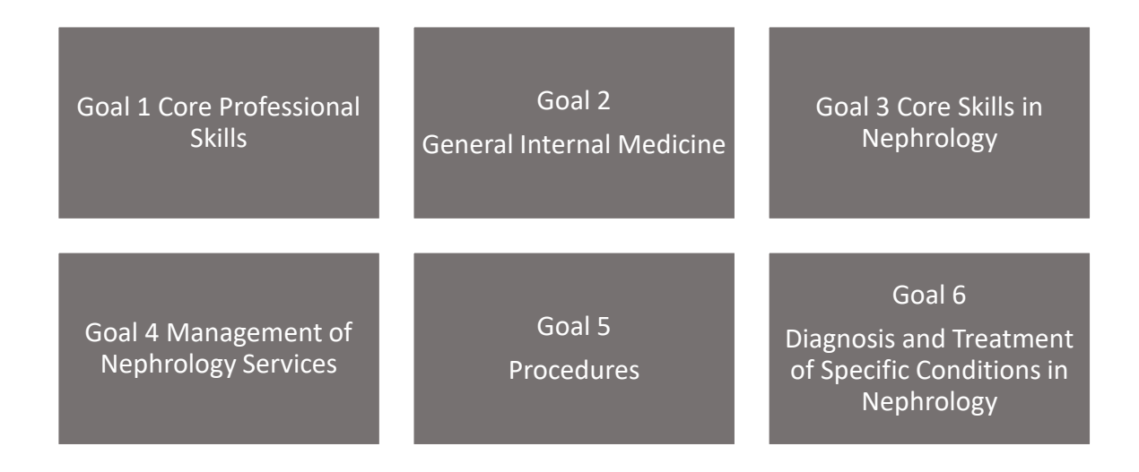
Figure 1 Outline of goals associated with the Nephrology and GIM curriculum

Not all the goals are of equal weight, and some may require the full duration of the programme to complete, for example goal 4 (Diagnosis and Treatment of Specific Conditions in Nephrology). Others, for example goal 1 (Core Skills in Nephrology,) are expected to be completed relatively early in the programme.